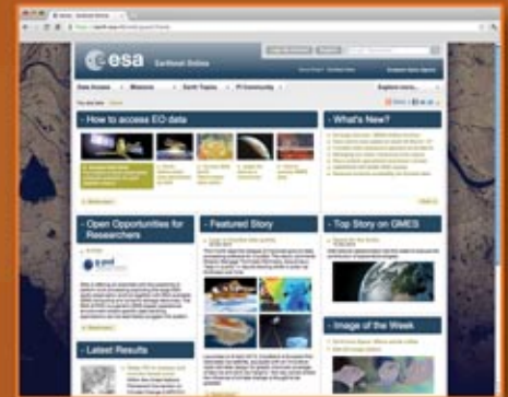
↓ Earthnet website

Requests for Mission Planning are subject to approval via a Project Proposal and shall then be submitted via EOLi-SA or dedicated forms for some TPMs (info available from the EOHelp).