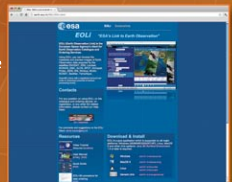
↓ EOLi website