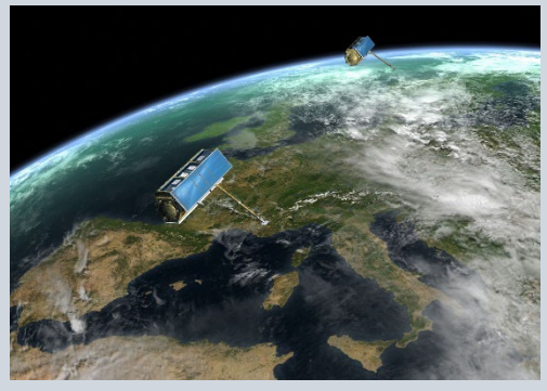
TerraSAR-X and TanDEM-X

The full archive and tasking collection contains all products for the satellites since November 2007. A Project Proposal must be submitted to request products from the collection, explaining the scientific application for the data.